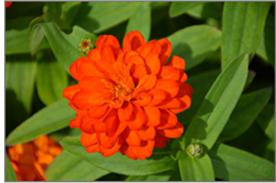
Profusion Double Fire Zinnia flowers