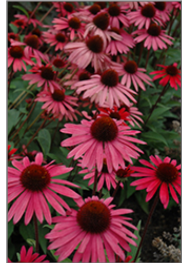
Big Sky Solar Flare Coneflower flowers

This is a relatively low maintenance plant, and is best cleaned up in early spring before it resumes active growth for the season. It is a good choice for attracting butterflies to your yard, but is not particularly attractive to deer who tend to leave it alone in favor of tastier treats. It has no significant negative characteristics.