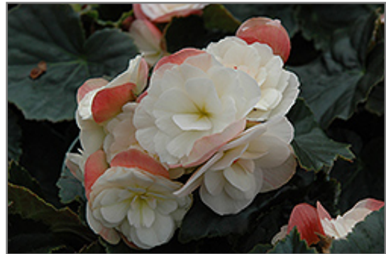
Dragone White Blush Begonia flowers

Hardiness Zone: (annual) Other Names: Hiemalis Begonia Group/Class: Rieger Begonia