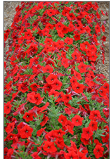
Easy Wave Red Petunia in bloom

Easy Wave Red Petunia is a fine choice for the garden, but it is also a good selection for planting in outdoor containers and hanging baskets. Because of its trailing habit of growth, it is ideally suited for use as a 'spiller' in the 'spiller-thriller-filler' container combination; plant it near the edges where it can spill gracefully over the pot. Note that when growing plants in outdoor containers and baskets, they may require more frequent waterings than they would in the yard or garden.