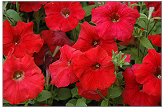
Easy Wave Red Petunia flowers

This plant will require occasional maintenance and upkeep. Trim off the flower heads after they fade and die to encourage more blooms late into the season. It is a good choice for attracting hummingbirds to your yard, but is not particularly attractive to deer who tend to leave it alone in favor of tastier treats. It has no significant negative characteristics.