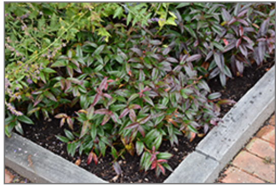
Scarletta Fetterbush

This shrub does best in partial shade to shade. It does best in average to evenly moist conditions, but will not tolerate standing water. It is not particular as to soil type, but has a definite preference for acidic soils. It is somewhat tolerant of urban pollution. This is a selection of a native North American species.