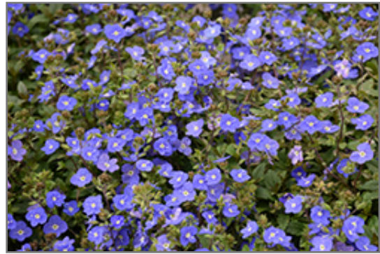
Georgia Blue Speedwell flowers

This is a relatively low maintenance plant, and is best cleaned up in early spring before it resumes active growth for the season. It is a good choice for attracting butterflies to your yard, but is not particularly attractive to deer who tend to leave it alone in favor of tastier treats. It has no significant negative characteristics.