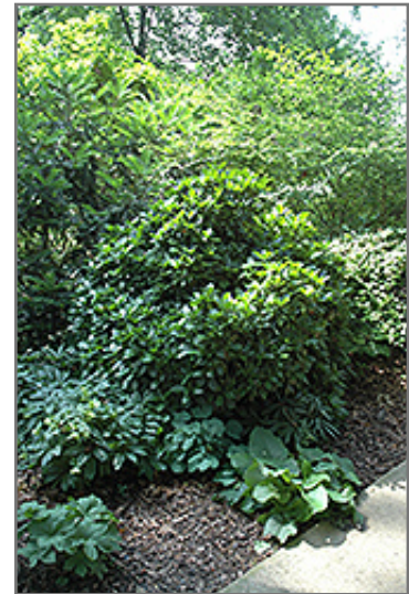
Roxanne Aucuba

Roxanne Aucuba will grow to be about 4 feet tall at maturity, with a spread of 4 feet. It has a low canopy. It grows at a fast rate, and under ideal conditions can be expected to live for approximately 20 years.