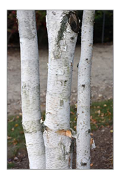
Whitebark Himalayan Birch bark