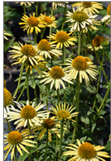
Maui Sunshine Coneflower flowers

The Original Family-Owned Garden Center 4320 Bridgeboro Road Moorestown, NJ 08057 Garden Center: (856) 461-0567 Landscaping: (856) 461-3359