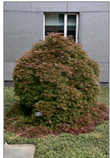
Orangeola Cutleaf Japanese Maple