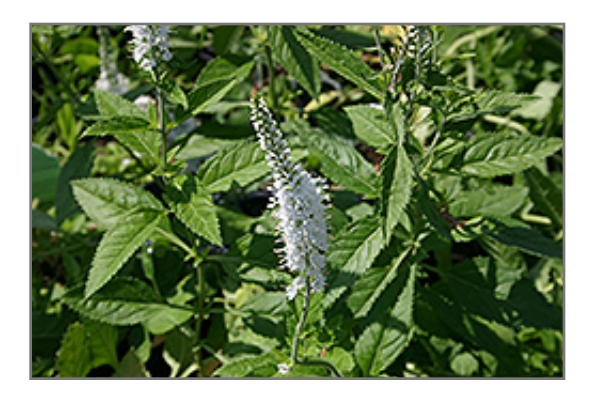
White Icicles Speedwell flowers