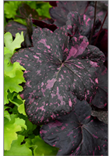
Midnight Rose Coral Bells foliage

Midnight Rose Coral Bells is recommended for the following landscape applications;