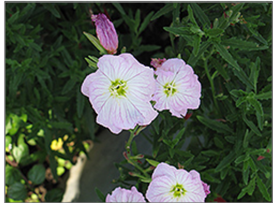
Evening Primrose flowers