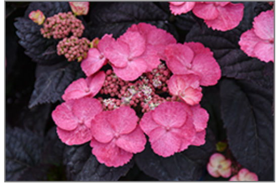
Pink Dynamo Hydrangea flowers

Pink Dynamo Hydrangea is recommended for the following landscape applications;