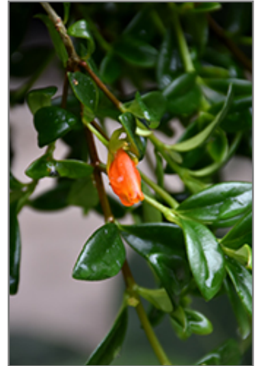
Goldfish Plant flowers

This is a dense herbaceous evergreen houseplant with a trailing habit of growth, eventually spilling over the edges of hanging baskets and containers. This plant can be pruned at any time to keep it looking its best.