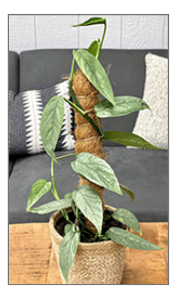
Beautifall Cebu Blue Pothos in

When grown indoors, Beautifall Cebu Blue Pothos can be expected to grow to be about 9 feet tall at maturity, with a spread of 24 inches. It grows at a fast rate, and under ideal conditions can be expected to live for approximately 10 years. This houseplant will do well in a location that gets either direct or indirect sunlight, although it will usually require a more brightly-lit environment than what artificial indoor lighting alone can provide. It does best in average to evenly moist soil, but will not tolerate standing water. The surface of the soil shouldn't be allowed to dry out completely, and so you should expect to water this plant once and possibly even twice each week. Be aware that your particular watering schedule may vary depending on its location in the room, the pot size, plant size and other conditions; if in doubt, ask one of our experts in the store for advice. It will benefit from a regular feeding with a general-purpose fertilizer with every second or third watering. It is not particular as to soil type or pH; an average potting soil should work just fine. Be warned that parts of this plant are known to be toxic to humans and animals, so special care should be exercised if growing it around children and pets.