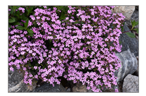
Rock Soapwort in bloom