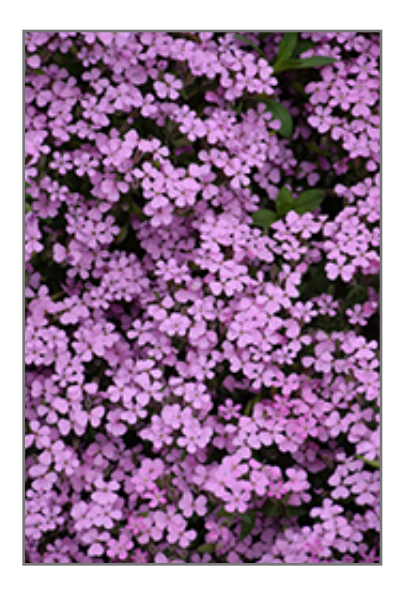
Rock Soapwort flowers