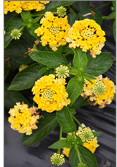
Landscape Bandana Lemon Zest Lantana flowers

Landscape Bandana Lemon Zest Lantana is a fine choice for the garden, but it is also a good selection for planting in outdoor containers and hanging baskets. Because of its spreading habit of growth, it is ideally suited for use as a 'spiller' in the 'spiller-thriller-filler' container combination; plant it near the edges where it can spill gracefully over the pot. Note that when growing plants in outdoor containers and baskets, they may require more frequent waterings than they would in the yard or garden.