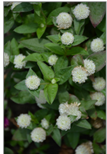
Ping Pong White Globe Amaranth flowers