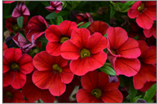
MiniFamous Uno Red Calibrachoa flowers

MiniFamous Uno Red Calibrachoa is a dense herbaceous annual with a trailing habit of growth, eventually spilling over the edges of hanging baskets and containers. Its medium texture blends into the garden, but can always be balanced by a couple of finer or coarser plants for an effective composition.