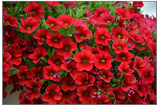
MiniFamous Uno Red Calibrachoa flowers