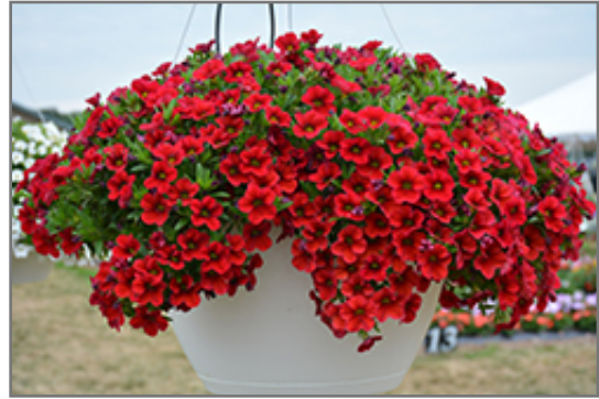
MiniFamous Uno Red Calibrachoa in bloom