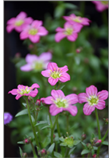
Touran Pink Saxifrage flowers

Touran Pink Saxifrage is recommended for the following landscape applications;