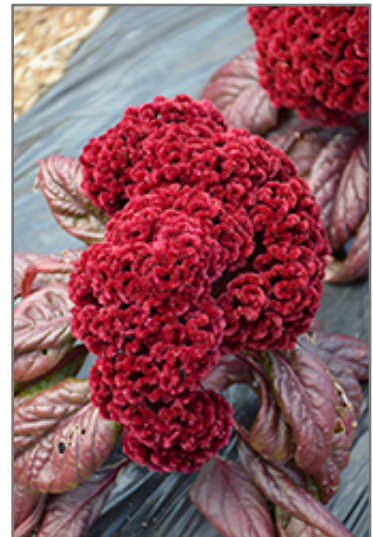
Dracula Celosia flowers