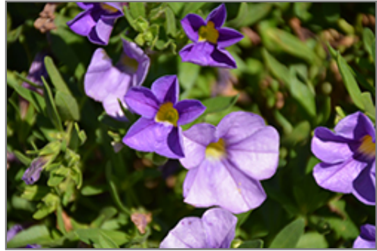
MiniFamous Neo Light Blue Calibrachoa flowers

MiniFamous Neo Light Blue Calibrachoa is recommended for the following landscape applications;