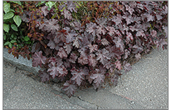
Stormy Seas Coral Bells

Stormy Seas Coral Bells is recommended for the following landscape applications;