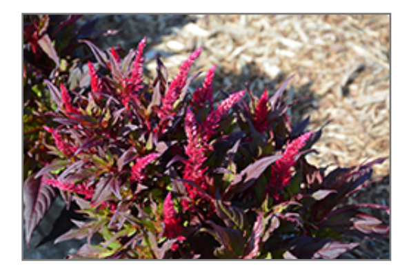
Kelos Atomic Scarlet Celosia flowers

The Original Family-Owned Garden Center 4320 Bridgeboro Road Moorestown, NJ 08057 Garden Center: (856) 461-0567 Landscaping: (856) 461-3359