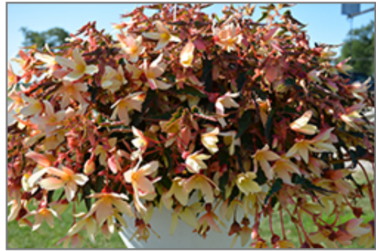
Bossa Nova Yellow Begonia in bloom