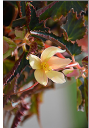
Bossa Nova Yellow Begonia flowers

Bossa Nova Yellow Begonia is an herbaceous evergreen perennial with a trailing habit of growth, eventually spilling over the edges of hanging baskets and containers. Its medium texture blends into the garden, but can always be balanced by a couple of finer or coarser plants for an effective composition.