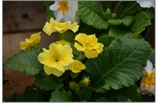
Primera Yellow Primrose in bloom

When grown indoors, Primera Yellow Primrose can be expected to grow to be only 5 inches tall at maturity, with a spread of 8 inches. It grows at a fast rate, and under ideal conditions can be expected to live for approximately 5 years. This houseplant performs well in both bright or indirect sunlight and strong artificial light, and can therefore be situated in almost any well-lit room or location. It requires an evenly moist well-drained soil for optimal growth, but will suffer if left to grow in standing water. The surface of the soil shouldn't be allowed to dry out completely, and so you should expect to water this plant once and possibly even twice each week. Be aware that your particular watering schedule may vary depending on its location in the room, the pot size, plant size and other conditions; if in doubt, ask one of our experts in the store for advice. It is not particular as to soil type or pH; an average potting soil should work just fine.