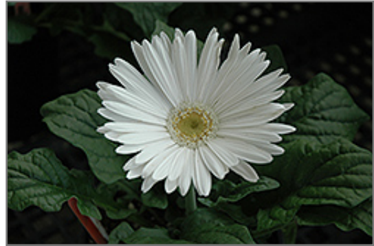
White Gerbera Daisy flowers