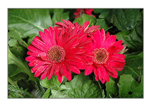
Royal Deep Rose Gerbera Daisy flowers

When grown indoors, Royal Deep Rose Gerbera Daisy can be expected to grow to be about 8 inches tall at maturity extending to 12 inches tall with the flowers, with a spread of 8 inches. It grows at a fast rate, and under ideal conditions can be expected to live for approximately 3 years. This houseplant will do well in a location that gets either direct or indirect sunlight, although it will usually require a more brightly-lit environment than what artificial indoor lighting alone can provide. It does best in average to evenly moist soil, but will not tolerate standing water. The surface of the soil shouldn't be allowed to dry out completely, and so you should expect to water this plant once and possibly even twice each week. Be aware that your particular watering schedule may vary depending on its location in the room, the pot size, plant size and other conditions; if in doubt, ask one of our experts in the store for advice. It is not particular as to soil type or pH; an average potting soil should work just fine.