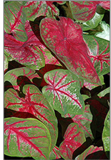
Scarlet Beauty Caladium foliage

A beautifully refined element to add to a shady site; stunning red, green and white leaves in different stages of variegation; a colorful room accent; an excellent display for containers, indoors or out