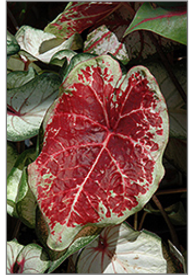
Raspberry Moon Caladium foliage

When grown indoors, Raspberry Moon Caladium can be expected to grow to be about 15 inches tall at maturity, with a spread of 18 inches. It grows at a medium rate, and under ideal conditions can be expected to live for approximately 10 years. This houseplant performs well in both bright or indirect sunlight and strong artificial light, and can therefore be situated in almost any well-lit room or location. It prefers to grow in average to moist soil. The surface of the soil shouldn't be allowed to dry out completely, and so you should expect to water this plant once and possibly even twice each week. Be aware that your particular watering schedule may vary depending on its location in the room, the pot size, plant size and other conditions; if in doubt, ask one of our experts in the store for advice. It is not particular as to soil type or pH; an average potting soil should work just fine.