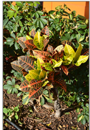
Variegated Croton