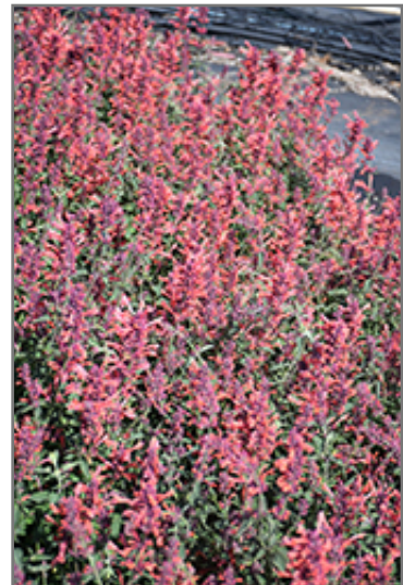
Kudos Coral Hyssop in bloom

The Original Family-Owned Garden Center 4320 Bridgeboro Road Moorestown, NJ 08057 Garden Center: (856) 461-0567 Landscaping: (856) 461-3359