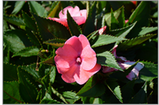
SunPatiens Spreading Shell Pink New Guinea Impatiens flowers

SunPatiens Spreading Shell Pink New Guinea Impatiens is recommended for the following landscape applications;