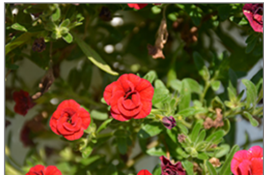
MiniFamous Double Compact Red Calibrachoa flowers