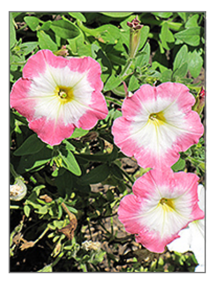
Madness Rose Morn Petunia flowers

The Original Family-Owned Garden Center 4320 Bridgeboro Road Moorestown, NJ 08057 Garden Center: (856) 461-0567 Landscaping: (856) 461-3359