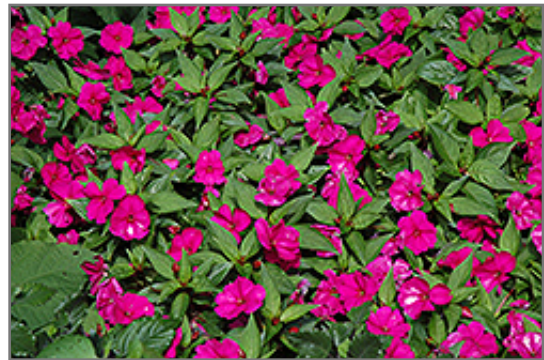
Big Bounce Violet Impatiens in bloom

The Original Family-Owned Garden Center 4320 Bridgeboro Road Moorestown, NJ 08057 Garden Center: (856) 461-0567 Landscaping: (856) 461-3359