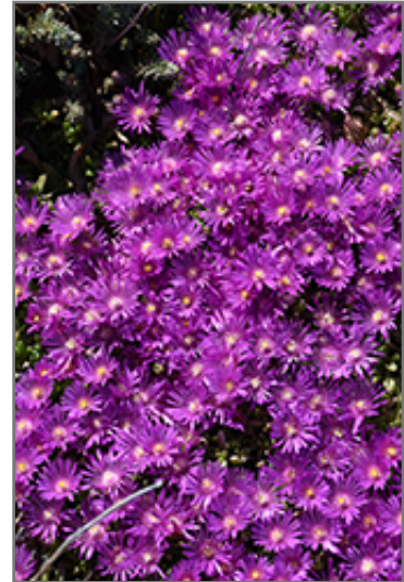
Table Mountain Ice Plant in bloom

Table Mountain Ice Plant is recommended for the following landscape applications;