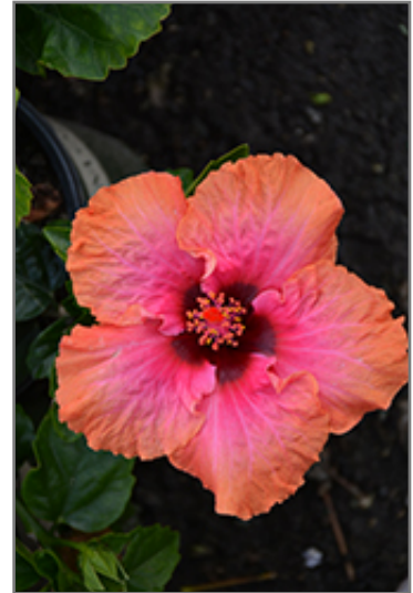
Erin Rachel Hibiscus flowers

This dazzling variety produces large, electric pink blooms with deep red eyes, and salmon-orange edges; makes an ideal hedge, screen, or background planting; do not allow to dry to wilting point