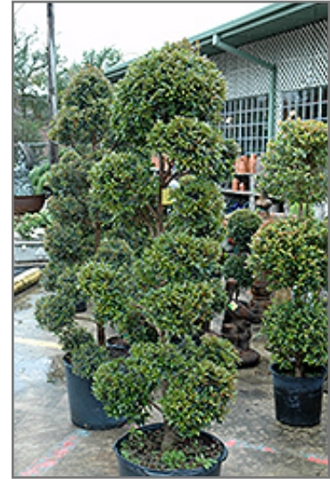
Brush Cherry

Brush Cherry is recommended for the following landscape applications;