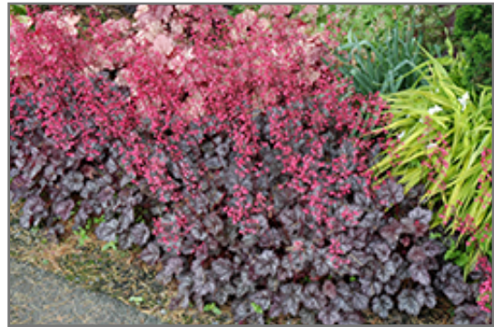
Glitter Coral Bells in bloom

Glitter Coral Bells is recommended for the following landscape applications;