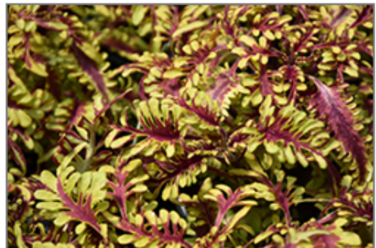
Under The Sea Bone Fish Coleus foliage

The Original Family-Owned Garden Center 4320 Bridgeboro Road Moorestown, NJ 08057 Garden Center: (856) 461-0567 Landscaping: (856) 461-3359