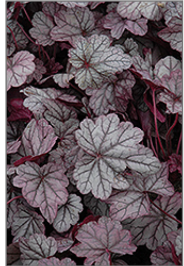
Carnival Sugar Plum Coral Bells foliage

This is a relatively low maintenance plant, and should be cut back in late fall in preparation for winter. It is a good choice for attracting hummingbirds to your yard. It has no significant negative characteristics.