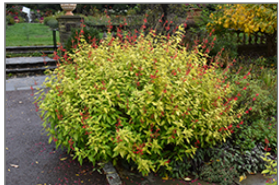
Golden Delicious Pineapple Sage in bloom