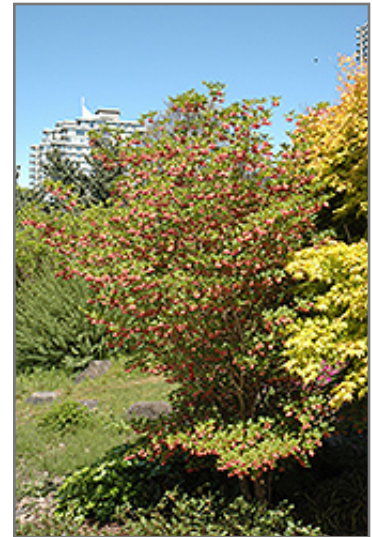
Redvein Enkianthus in bloom

The Original Family-Owned Garden Center 4320 Bridgeboro Road Moorestown, NJ 08057 Garden Center: (856) 461-0567 Landscaping: (856) 461-3359