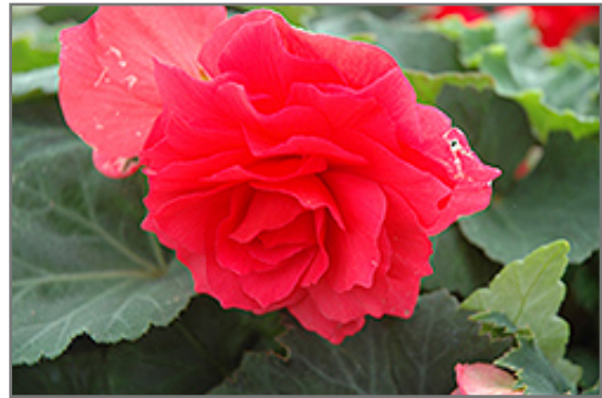
Nonstop Bright Red Begonia flowers

A spectacular upright begonia presenting lovely dark, heart-shaped foliage; large, colorful double blooms are produced throughout the season; grows well in hot and humid conditions; great for containers, hanging baskets or garden landscapes