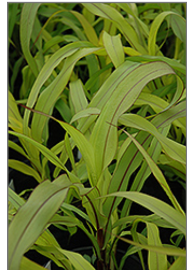
Jester Millet foliage

The Original Family-Owned Garden Center 4320 Bridgeboro Road Moorestown, NJ 08057 Garden Center: (856) 461-0567 Landscaping: (856) 461-3359