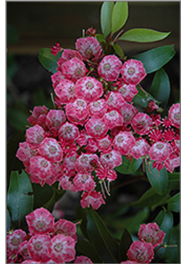
Pink Charm Mountain Laurel flowers

Pink Charm Mountain Laurel will grow to be about 10 feet tall at maturity, with a spread of 10 feet. It has a low canopy with a typical clearance of 1 foot from the ground, and is suitable for planting under power lines. It grows at a slow rate, and under ideal conditions can be expected to live for 50 years or more.