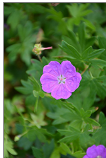
New Hampshire Purple Cranesbill flowers

New Hampshire Purple Cranesbill will grow to be about 18 inches tall at maturity, with a spread of 3 feet. When grown in masses or used as a bedding plant, individual plants should be spaced approximately 30 inches apart. Its foliage tends to remain dense right to the ground, not requiring facer plants in front. It grows at a medium rate, and under ideal conditions can be expected to live for approximately 10 years. As an herbaceous perennial, this plant will usually die back to the crown each winter, and will regrow from the base each spring. Be careful not to disturb the crown in late winter when it may not be readily seen!