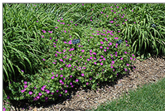
New Hampshire Purple Cranesbill in bloom