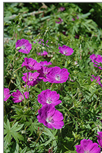
New Hampshire Purple Cranesbill flowers

This is a relatively low maintenance plant, and should only be pruned after flowering to avoid removing any of the current season's flowers. Deer don't particularly care for this plant and will usually leave it alone in favor of tastier treats. It has no significant negative characteristics.