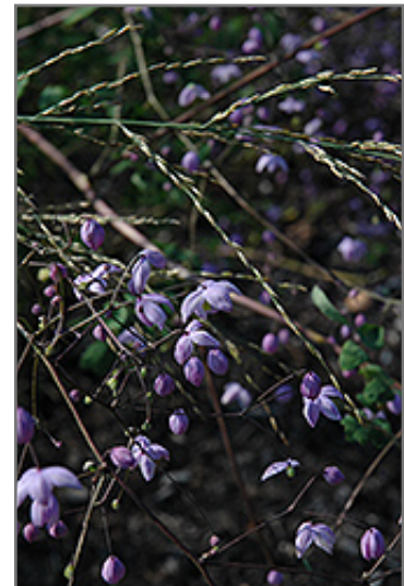
Splendide Meadow Rue flowers